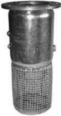
3/4" Drain Coupler Standard On Foot Valves